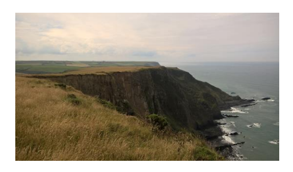
Suitable stretch of cliff for nest box