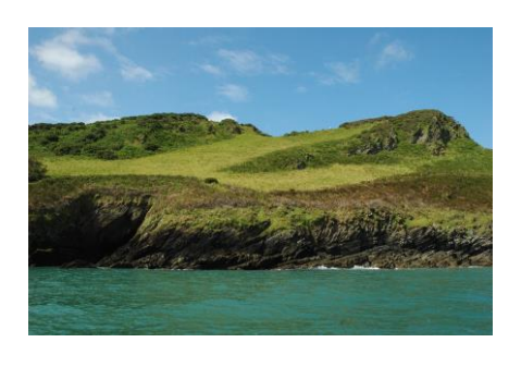
Widmouth Head, an area that could be brought into suitable condition for chough