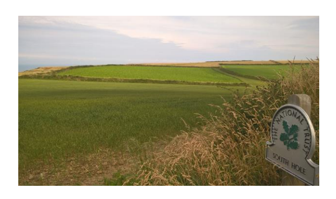
Arable near cliffs is important for seed and invertebrate prey especially if managed with low-input spring cereals then overwintered stubble