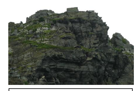
Valley of the Rocks showing narrow crevices, a site for a nest box