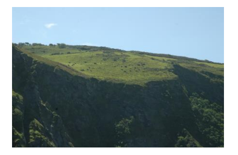
Cliff top grazing Torrs area. An area to target more intensive management by cattle grazing and scrub/bracken control. Site nest box on more open cliffs nearby