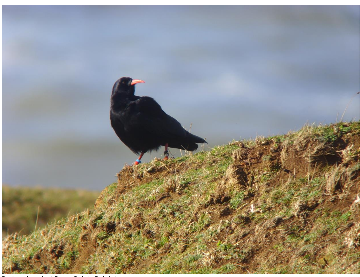
Breton chough at Baggy Point.