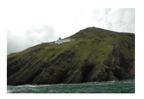
Foreland Point – potential site for nest box