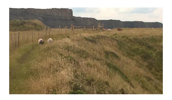
Sheep grazing on unenclosed cliffs between South Hole and Welcombe

10. Example site. South Hole – Welcombe, where combined existing good habitat, potential for more management and nest box provision could provide suitable conditions for chough