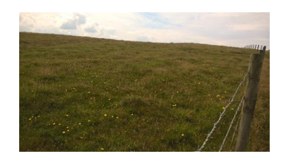
Shorter flower-rich swards suitable for chough. Fencing from footpath = less disturbance