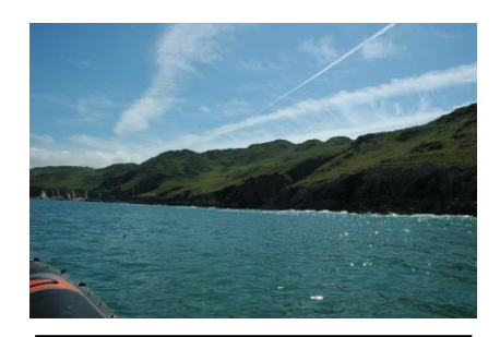
Low-lying cliffs at Morte. The wider area could support choughs with some changes to grazing management