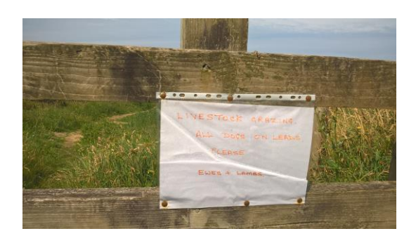
Signage to help interpret grazing needs to be obvious and robust