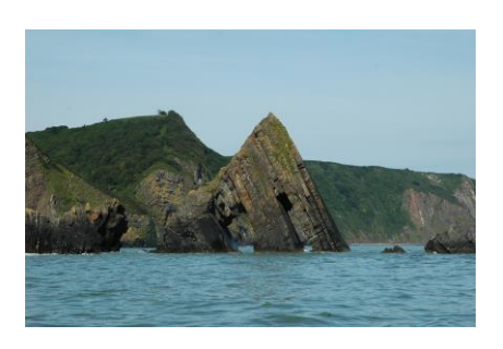
Vegetated cliffs with few typical nest sites between Hartland/Clovelly Potential for boxes