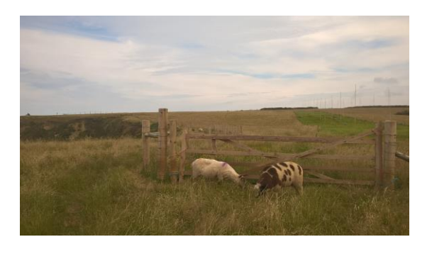
Grazing and cutting should ensure some short open areas are available year round-(ie not all long grass in spring/summer)