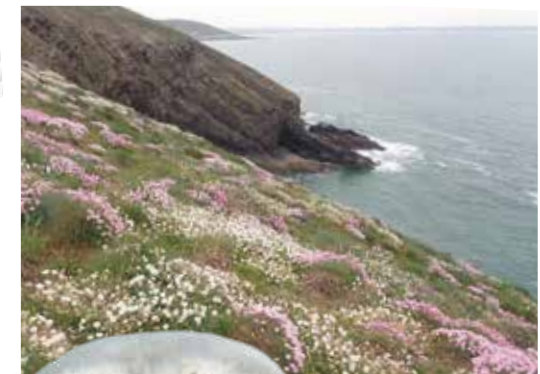
Wild flowers on Baggy Point