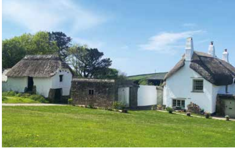
The 15 th century East Titchberry Farm

This peaceful 3-mile circular route begins at the National Trust car park, leading you through the farmyard and out towards the coast before joining the South West Coast Path. Here you can enjoy wide sea views and rugged cliff-top scenery, before the trail loops inland through open farmland, historic fields, quiet bridleways and hedged lanes, bringing you back to East Titchberry with a real sense of the North Devon coastline.