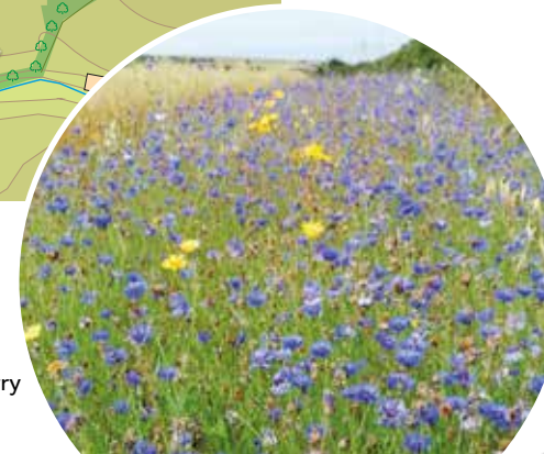
Wildflowers at Titchberry

Level 2 according to the Disabled Ramblers grading system.