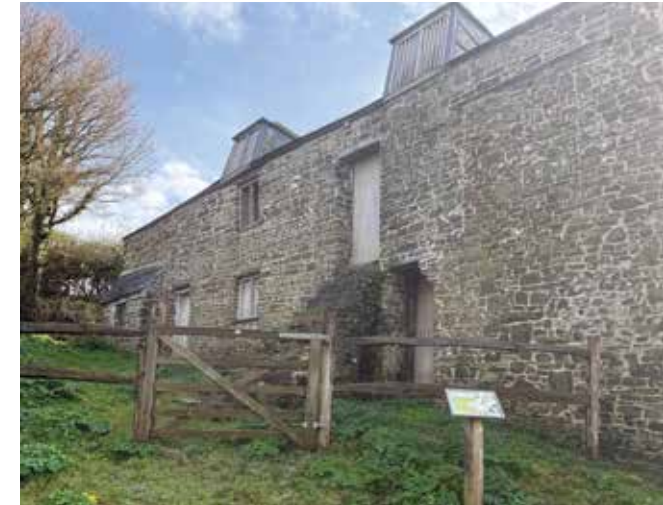
The 17 th century malthouse at East Titchberry Farm

Follow ancient Devon hedge banks and old field boundaries as you make your way towards the coast. Much of this landscape has been shaped for centuries by farming and maritime activity.