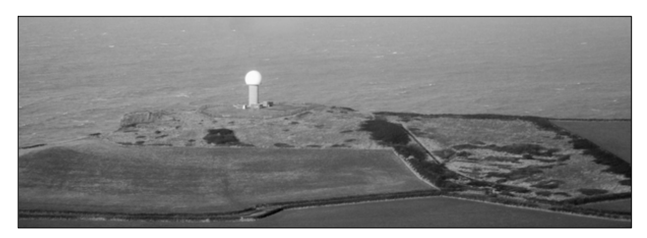
The former RAF sites photographed in 2008. The WWII station occupied the hill slope between the modern airtraffic control radar tower and the highway, seen running left to right in the bottom of the photograph. The site of most of the post-war station appears in the photograph. This occupied the uncultivated land around the modern radar, the hedged field on the right of the picture and a small area beyond. The bases of the guardroom, the standby set and the R8 operations block can just be discerned within the hedged field.

week involving air firing by aircraft from RAF Chivenor<sup>32</sup>