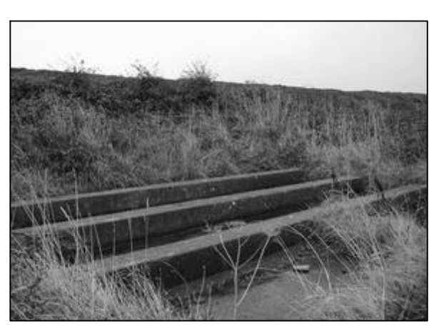
Supports for fuel tanks.