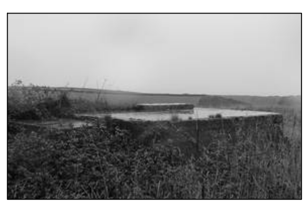
The remains of a Type 13 cabin.

At the domestic site most of the buildings have been demolished, but the shell of a former motor transport shed still stands, as do the former houses of the married quarters, now in civilian use. One or two huts on the site originate from the RAF's one-time occupation of the area.