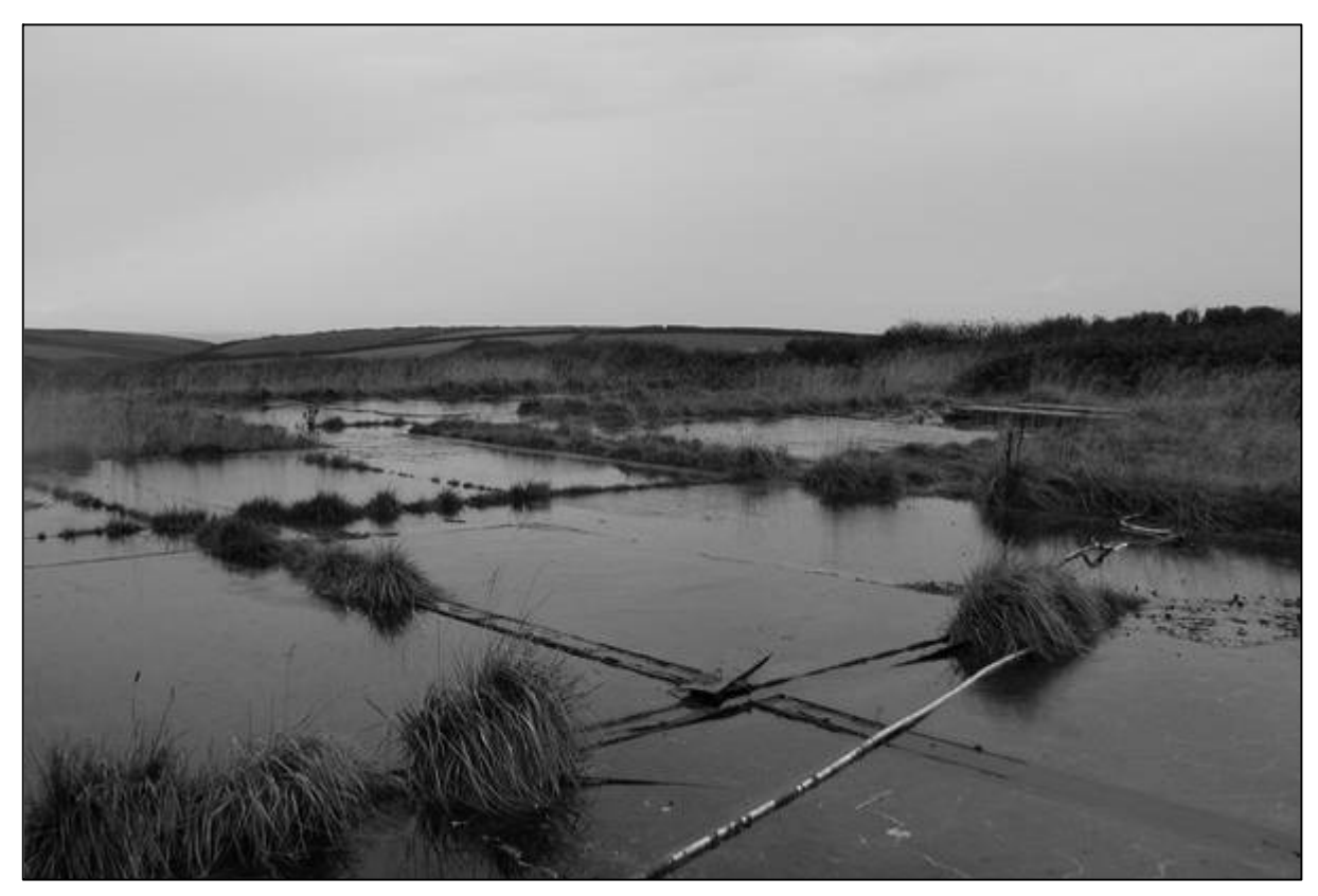
The remains of flooring of the R8 operations building.