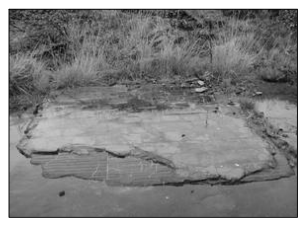
Floor tiles in one area of the R8 building can still be identified.