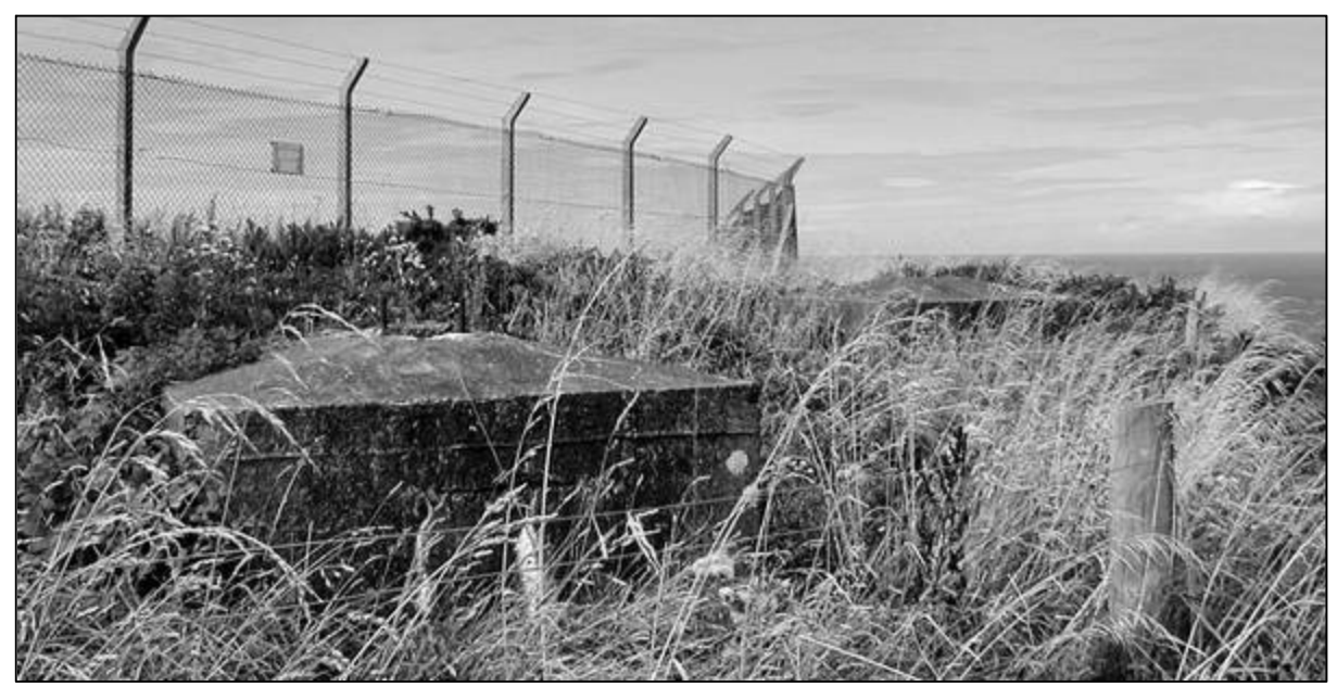
Aerial bases adjacent to a cliff-top public footpath and the modern radar compound.